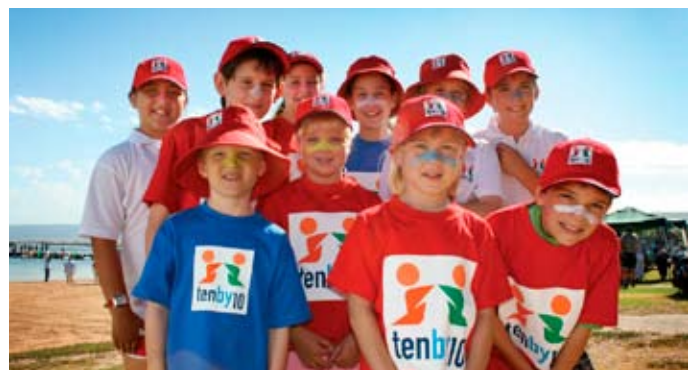
Children taking part in the tenby10 project

All stakeholders remain committed to maintaining their focus on the project and realising their target of 95% by the end of 2010. For further information visit www.tenby10.com