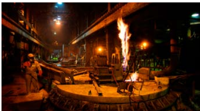
Transferring lead to the dross floor in the Port Pirie Smelter

The project has a comprehensive outreach programme involving all parts of the community, providing guidance and education on minimising exposure to lead. Community members can join a CANdo Group – Community Action Network delivering outcomes – which works in conjunction with the tenby10 project to raise the profile of the project in the community and assist in delivering outcomes.